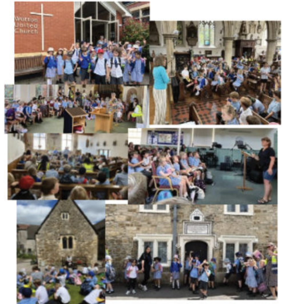
Blue Coat School KS1 Church Trail