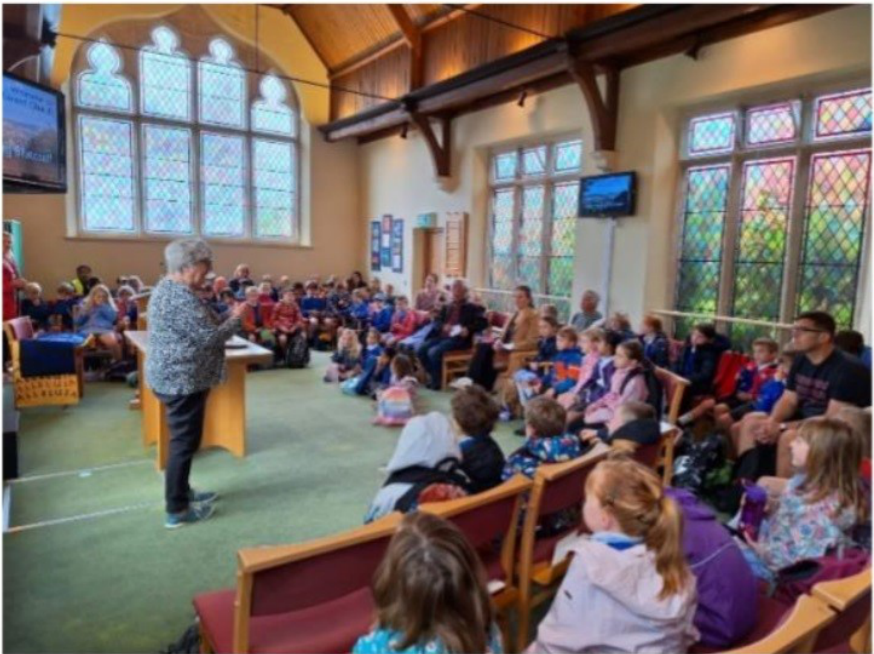
Blue Coat infants visit Wotton United Church (see article)