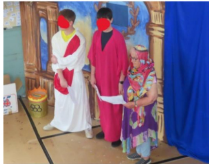
Figure 4 More Drama