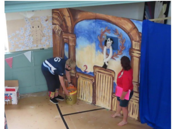
Figure 5 Gertie the Dog and her 2 human helpers

In case you're wondering, only the faces of the children whose parent/guardian has given permission are shown. Others are obscured.