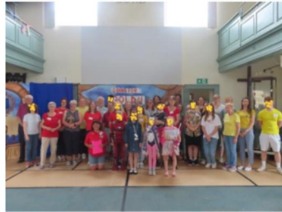
Figure 2 Team Photo from Wednesday