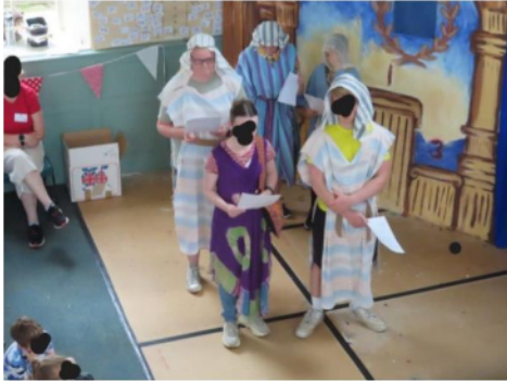
Figure 3 Drama